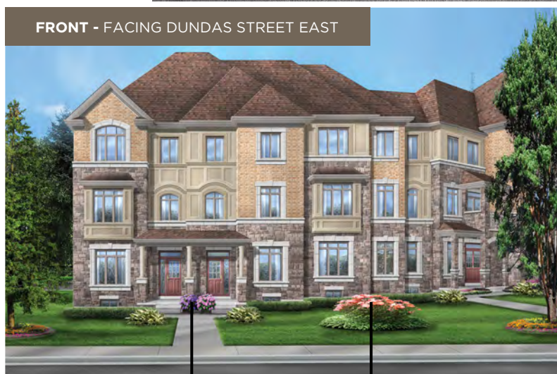
FRONT - FACING DUNDAS STREET EAST