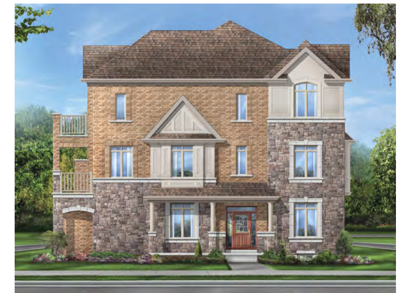
LIBERTY 6 FLANKAGE ELEV. 2 • TH-106 | 2,343 Sq.Ft.