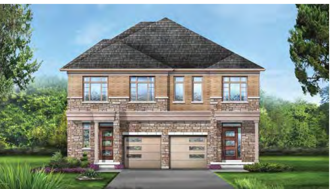
GLENDALE 2A • ELEVATION 5 GLENDALE 2A • ELEVATION 6 GLENDALE 20 • ELEVATION 3